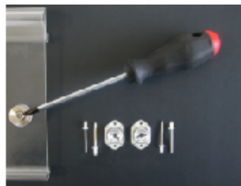
Sample 1 Line E-Z Trac Locking kit

E-Z Trac's locking system is sold per each line of text, with the locking units preinstalled on both ends of the letterholder. Also supplied are the locking receptacles, rivets, and torx driver. You simply align the supplied template which indicates your drilling locations, install the receptacles with the supplied rivets and you are done.