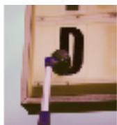
suction cup problems

E-Z Trac was designed to solve many of the problems associated with changeable letter readerboards. Looking at the photos below, you probably recognize a few of these common issues.