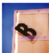
letters behind rail