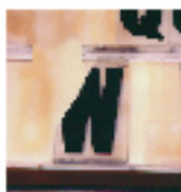
broken letters and rails