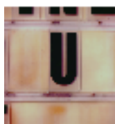
dirt and ice behind rail